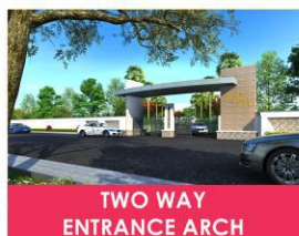
TWO WAY ENTRANCE ARCH